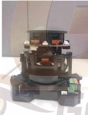
No Visible Damage