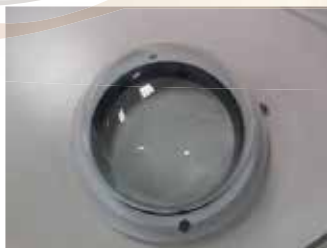
No Visible Damage